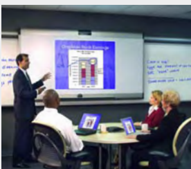
PolyKey™ Technology for instant plug-and-play