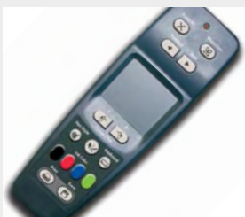
Intuitive Remote Control