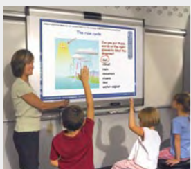
Interruption-free meetings and classes

* Walk-and-Talk board shown on Power and Data Track System over an Access™ Premium Whiteboard