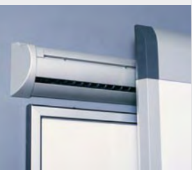
Power and Data Track *