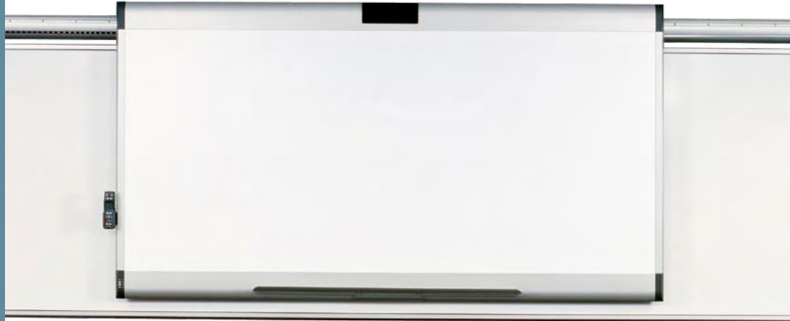
* Walk-and-Talk board shown on Power and Data Track System over an Access™ Premium Whiteboard