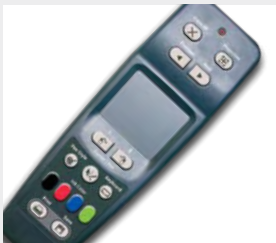
Intuitive Remote Control