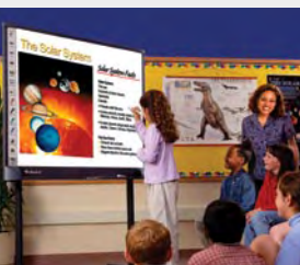
Improve Group Interactivity