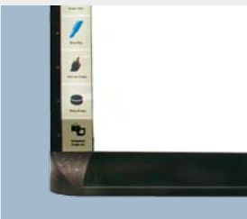
Interactive Projection on a Touch-sensitive Surface