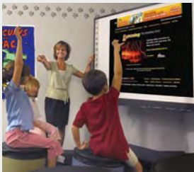
Interruption-free meetings and classes