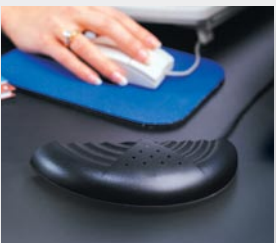
Optional Wireless Communication