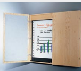
Optional Enclosures and Mobile Stands

PolyVision's TS Series of Interactive Whiteboards is ideal for power users who prefer to learn product-specific software.